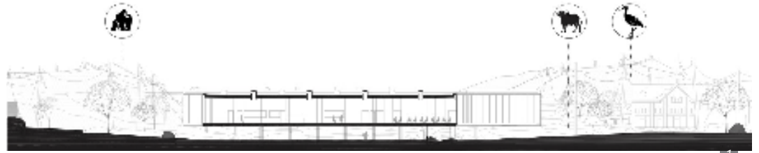
Figure 1. Section ©Studio Farris Architects

Since its founding, the Antwerp Zoo has been managed by KMDA, the Royal Zoological Society of Antwerp.