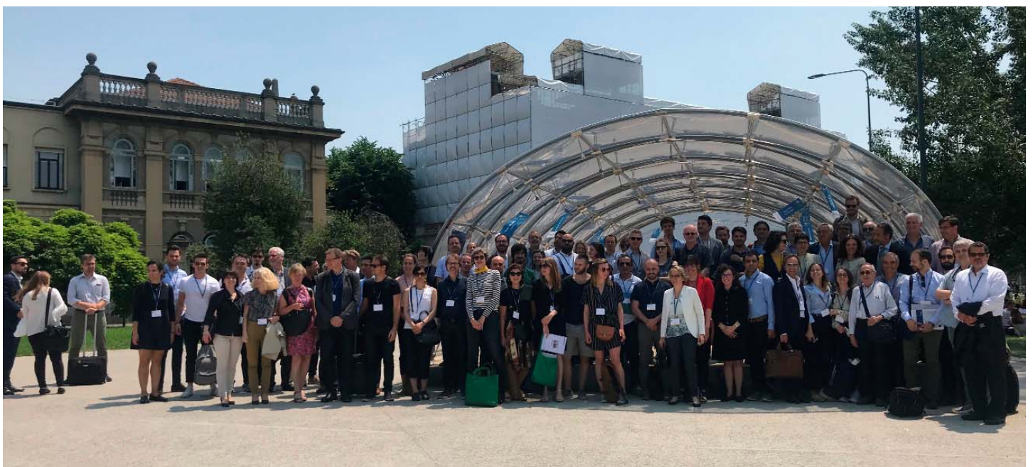
Group photo of the TensiNet Symposium 2019 participants in front of the TemporActive Pavilion

TensiNet Annual General Meeting & Partner Meeting 2/2019 | 08/10/2019 at 19.00 (during symposium Form and Force 2019)